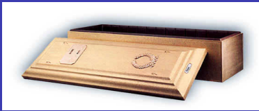
A lined, sealable, "Titan" vault from the Stone Vault Co., LLC.

These are made available to funeral directors at wholesale prices. Ask your funeral director about Doric-brand vaults from St. Joseph Cemetery.